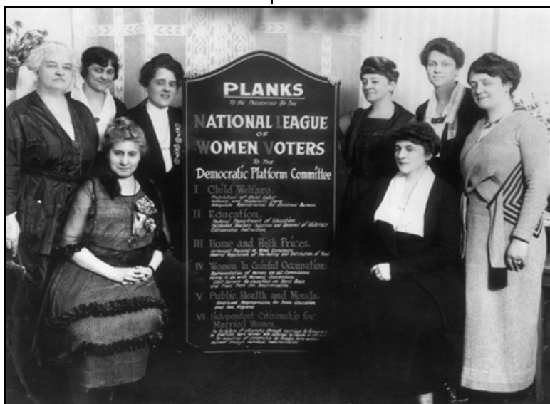
An early program planning meeting?

Both of these proposals and others that surface before January 30 th will be discussed at the meeting.